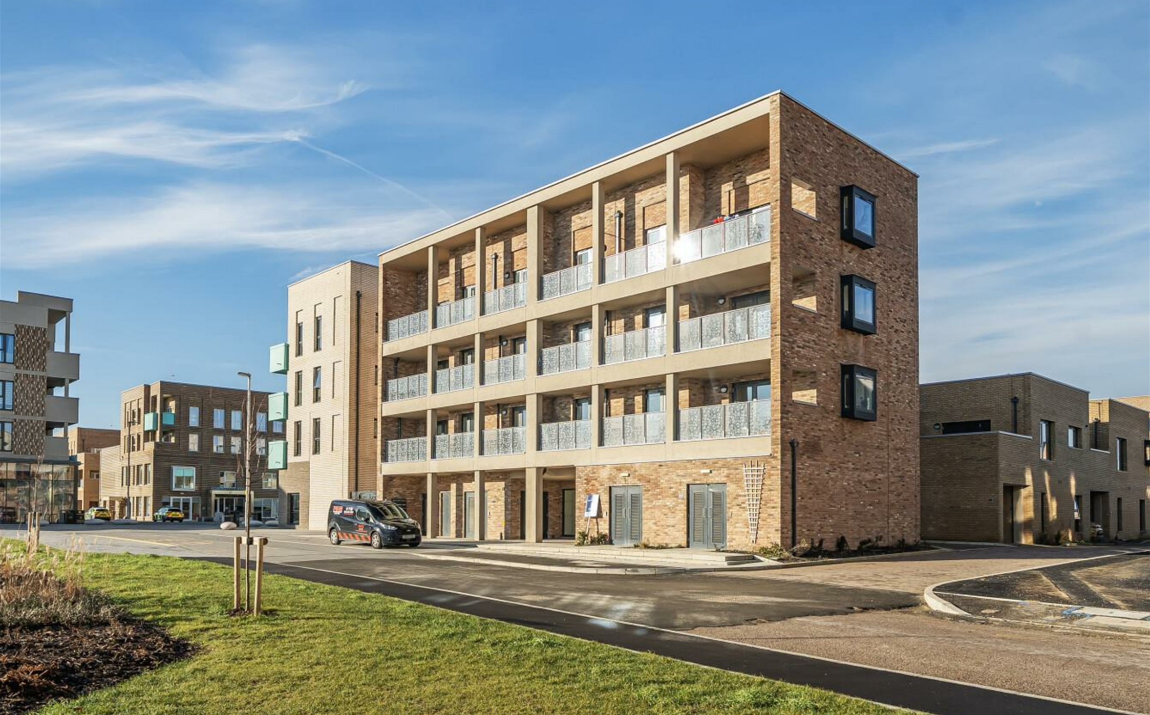
Evolution Court, Cambridge, CB3 0UN